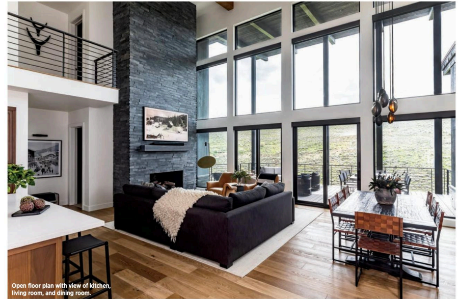
Open floor plan with view of kitchen, living room, and dining room.

W hen finishing and furnishing a Park City mountain house for longtime Highland Park clients, Rebel House Design took inspiration from its setting—Utah's spectacular Painted Valley.