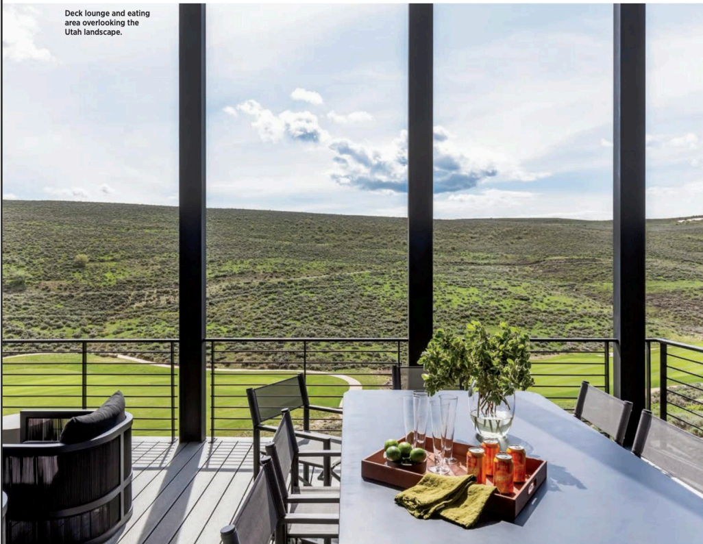
Deck lounge and eating area overlooking the Utah landscape.

WORDS BY MONICA KASS ROGERS